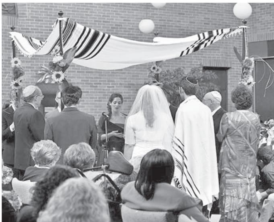
Under the chupah with family and friends